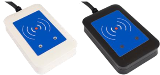
Desktop version (inlay customizable)

Elatec's TWN4 family of transponder readers and writers allows users to read and write to almost any 125 kHz, 134.2 kHz and 13.56 MHz tags and/or labels. It supports all major transponders from various suppliers like ATMEL, EM, ST, NXP, TI, HID, LEGIC, etc. and ISO standards like ISO14443A/B (T=CL), ISO15693, ISO18092 / ECMA-340 (NFC).